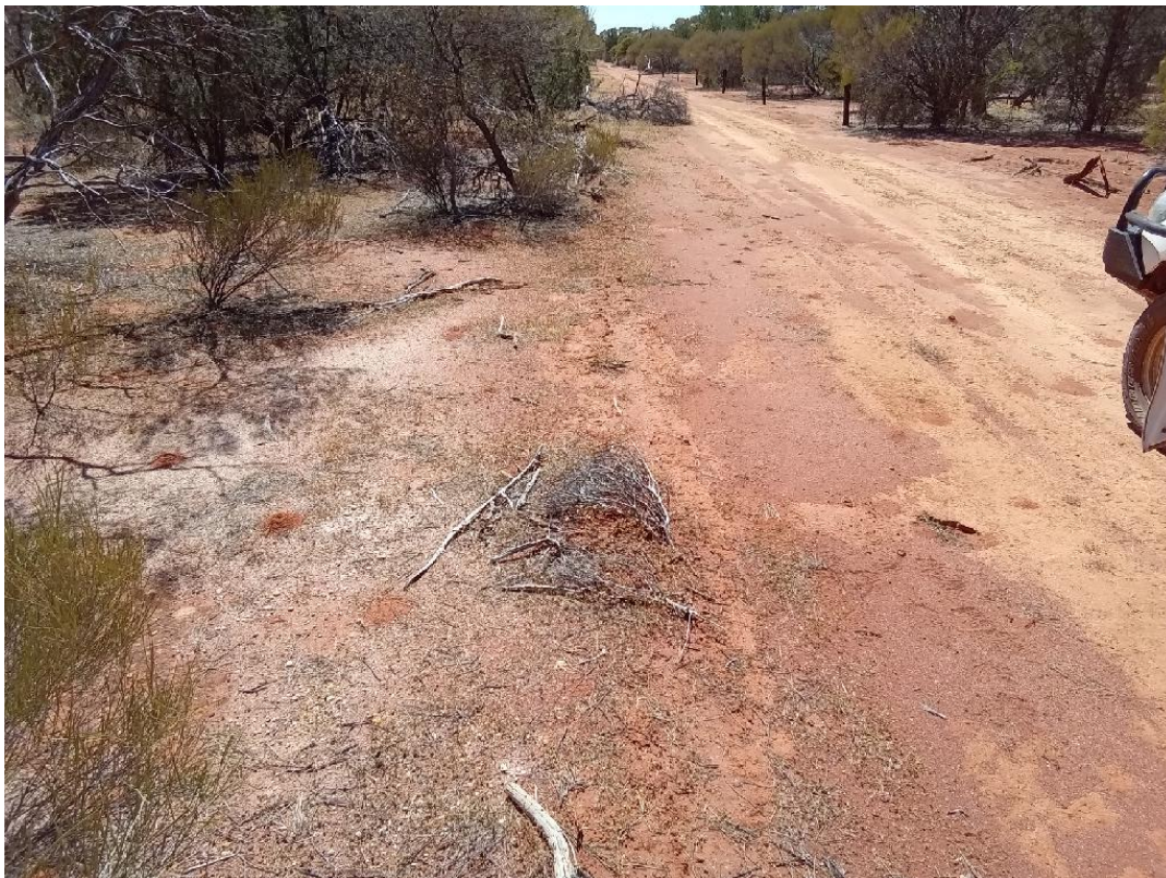
Figure 1. Remains of historic aircore drilling at Toben Bore target, Lang Well Project.

“Given the large areal extent of the auger REE anomalism, the strongly elevated La and Ce results, and the lack of any systematic REE analysis, there is potential for a significant amount of shallow REE mineralisation to be outlined at Lang Well,” he added.